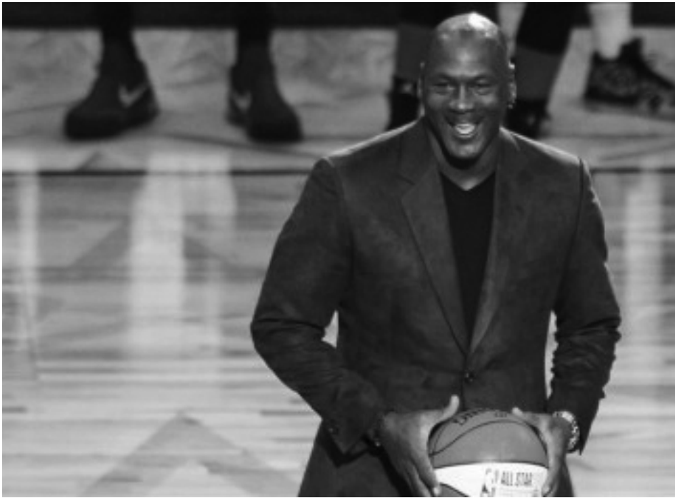
THE GOAT. Michael Jordan in this undate photo. Jordan's collection of sneakers sold Friday (Feb. 2, 2024) for a record USD8 million at a Sotheby's auction.

Michael Jordan's collection of sneakers sold Friday for a record USD8 million at a Sotheby's auction.