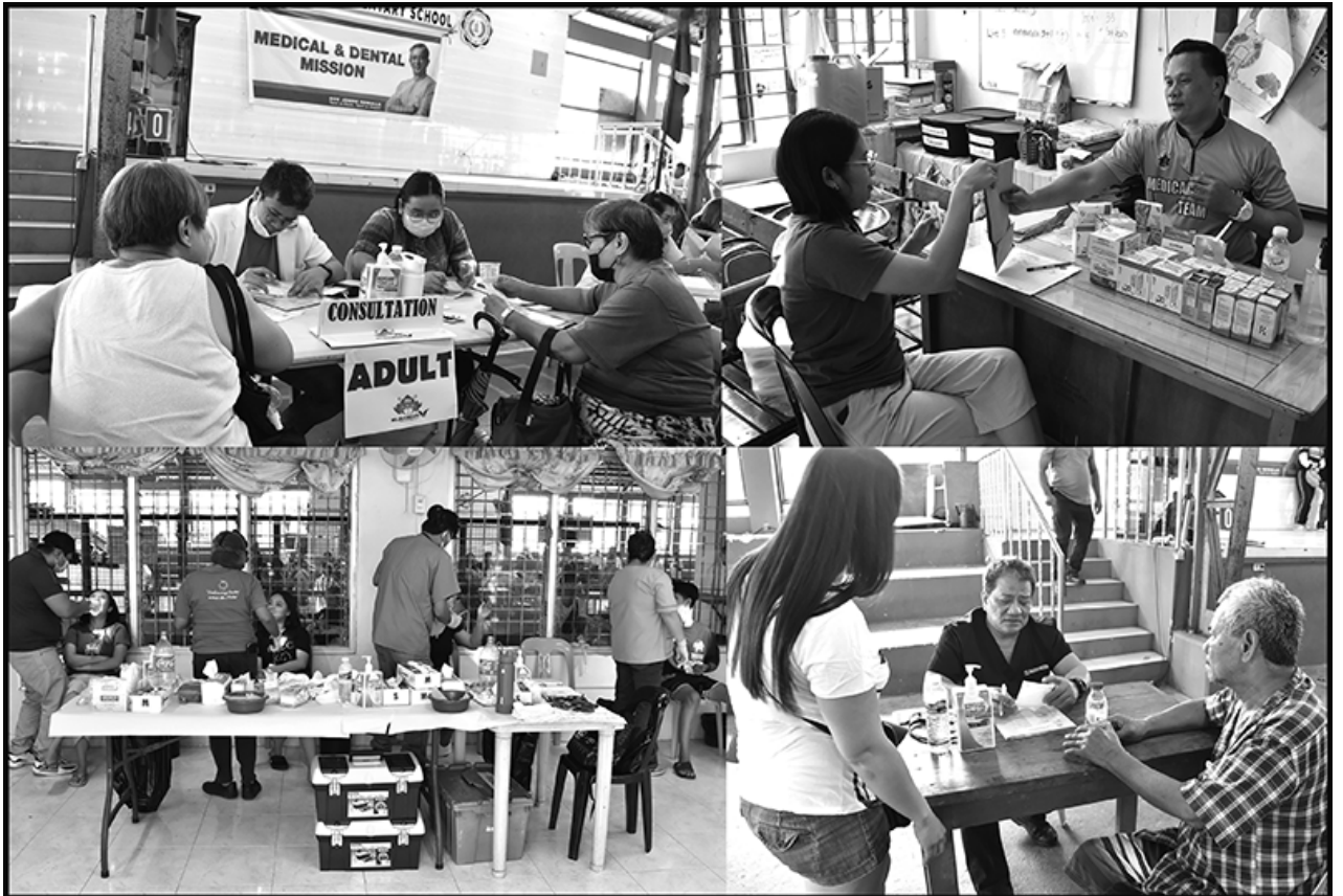
lives of hundreds of individuals within the community. (OPIO)

The success of the mission would not have been possible without the collaboration and coordination of various stakeholders, including local officials, and volunteers. Their collective efforts made it possible to create a positive impact on the