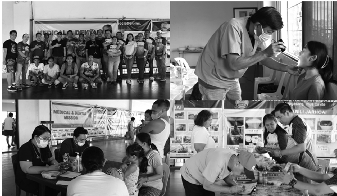
Cavite provincial government's Medical Mission Team composed of dedicated staff from the Office of the Provincial Governor and the Office of the Provincial Health Officer, in collaboration with the Cavite Varsitarian-Imus Council, organized a successful medical and dental mission on January 25, 2024 at Jade Residence Subdivision in the City of Imus. The event provided free health consultations and check-ups to 506 patients, with a dedicated team addressing individual health concerns. Notably, 50 patients received free tooth extractions, emphasizing the importance of dental health. The mission, held in a strategic community location, aimed not only to address immediate health needs but also to promote health awareness and preventive care. The team expressed gratitude for the collaborative effort, highlighting the significance of community engagement in bridging healthcare gaps. The initiative's success reflects a commitment to prioritizing the health of Imus residents and serves as a model for future healthcare initiatives in communities. (OPIO)