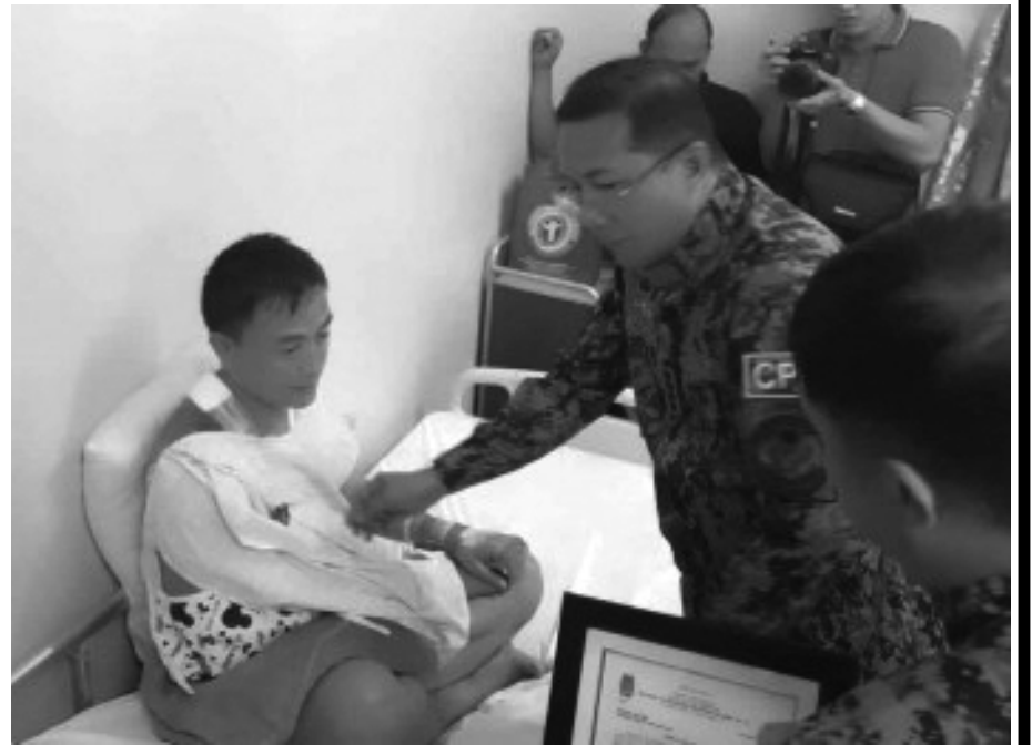
COURAGE. Philippine National Police (PNP) chief Gen. Benjamin Acorda bestows an award to a police officer injured in an encounter with the criminal group in Samar during his visit to Calbayog City Friday (Feb. 2, 2024). The official reminded policemen to stay away from politics and uphold and protect the Constitution.

The Philippine National Police (PNP) leadership on Friday reminded all personnel to stay away from politics but to continue to uphold and protect the Constitution at all times.