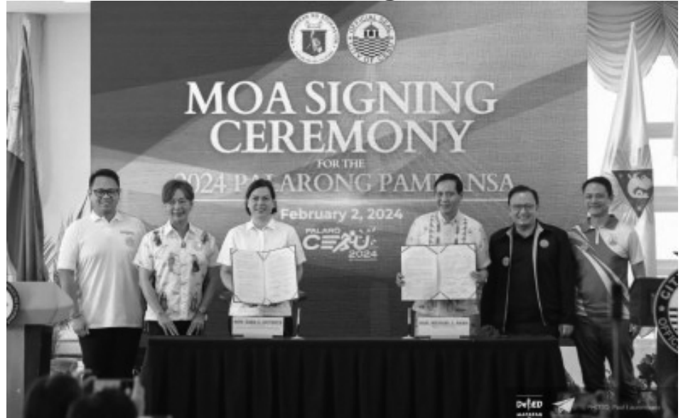
PALARO HOSTING. Vice President and Education Secretary Sara Duterte-Carpio (3rd from left) and Cebu City Mayor Michael Rama (3rd from right) pose after signing a memorandum of agreement (MOA) to ensure the intensive preparation for the 2024 Palarong Pambansa, in a ceremony at the Cebu City Hall Executive Building on Friday (Feb. 2, 2024). Cebu City will be hosting the annual tournament for elementary and high school students for the third time.

The 2019 edition of the tournament for elementary and high school students was held in Davao City.