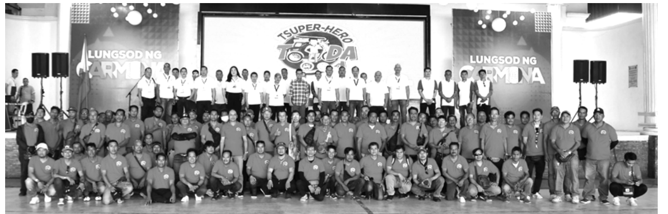
110 'TSUPER HEROES' NG CARMONA, BINIGYANG PAGKILALA: Talaga namang 'Honesty is the Best Policy' sa lungsod ng Carmona patapos bigyang pagkilala ng lokal na pamahalaan ang 110 na miyembro ng mga Tricycle Operators and Driver's Association (TODA) noong Enero 16, 2024. Sila ang mga tapat at natatanging tsuper na nagpamalal ng kanilang katapatan at kabutihan sa mga commuter tulad ng pagbabalik ng mga naiwang gamit tulad ng cellphone o wallet. Ayon sa pamahalaang lungsod, sila ang mga natatanging bida ng lansangan dahil sa kanilang kagitingan na sumasalamin sa kabutihan ng kanilang komunidad. #TODATsuperHero

supporting online teaching and learning. "We can't deny that we live in a competitive world where we have to make sure we do not fall behind. It is essential that we stay up-to-date," she added.