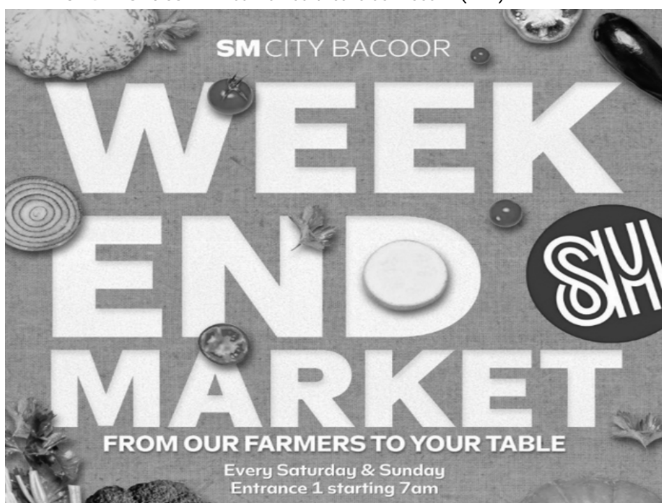
GET FRESH PRODUCE AT SM CITY BACOOR'S WEEKEND MARKET: SM CITY BACOOR, CAVITE - Discover the freshest produce at SM City Bacoor's Weekend Market, a vibrant harvest haven that invites shoppers to indulge in farm-to-table goodness every Saturday and Sunday at Entrance 1, starting 7:00 AM. Local farmers and producers showcase their finest crops, ensuring a direct link from their farm to your table. From crisp vegetables to fresh fruits and dairy produce, the market offers a diverse array of high-quality products. This not only supports local businesses but also allows shoppers to savor the authenticity and goodness of freshly harvested ingredients. Join us in celebrating the joy of community, sustainability, and delectable finds at SM City Bacoor's Weekend Market.