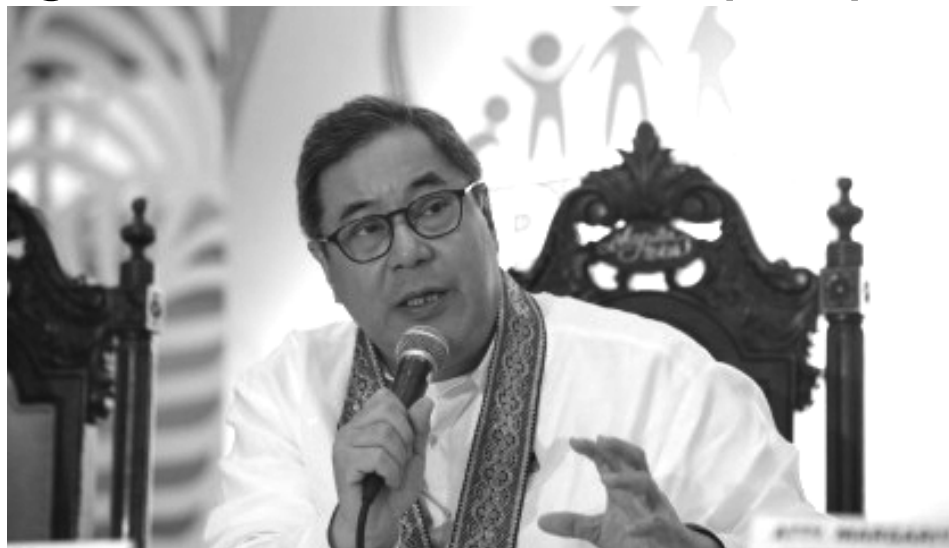
Health Secretary Teodoro Herbosa

The member agencies of the council include the Department of Information and Communications Technology, Department of Budget and Management, Department