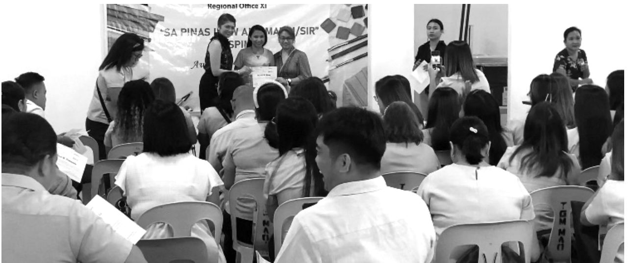
DMW-XI turns over some teaching kits worth P20,000 to 44 returnee OFW teachers under the SPIMS program of the agency.

however, all had little chance of getting hired and securing a permanent teaching position.