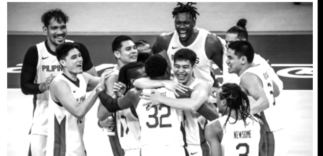
CHAMPION AGAIN. Members of the Gilas Pilipinas celebrate the country's first gold medal in 61 years in the Asian Games in Hangzhou, China on Oct. 6, 2023. Gilas' miraculous run became the top newsmaker in sports for 2023.

While the other three Asian Games golds headlined by that of men's pole vault favorite EJ Obiena are not to be