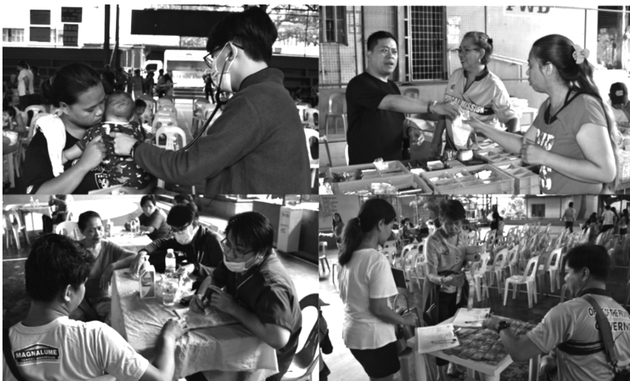
Medical Mission in Paliparan 3: Touching lives and spreading healing at Barangay Paliparan III, City of Dasmariñas, Cavite. On December 27, 2023, the Office of the Provincial Governor-Medical Mission Team, alongside dedicated doctors and volunteers from the Office of the Provincial Health Officer, conducted a compassionate medical mission, providing free check-ups, consultations, and essential medicines to 594 grateful patients. The health outreach made an impact to the community as it addressed the primary health concerns of the residents at no cost, a testament to the dedicated service and of the provincial government of Cavite. (OPIO)

Maghahain din ako ng Senate Resolution upang imbestigahan at mapanagot ang mga nasa likod ng hindi katanggap-tanggap na power outage na ito sa Panay island.