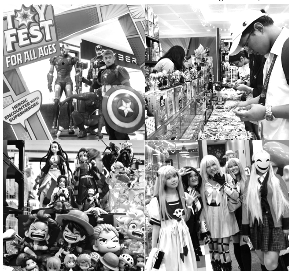
TOY FESTIVAL AT SM CITY TRECE MARTIRES: Toy enthusiasts and cosplayers gathered at SM City Trece Martires for the Toy Fest for all ages on December 25 to 30, 2023. Favorite collectibles from various animes, cartoons, and superheroes were displayed and exhibited while South Cosplayers showcased their cosplay and runway skills here at SM City Trece Martires!

"Also, road safety, dumarami ang namamatay (the number of deaths is increasing) due to accidents involving motorcycles because more people are learning to drive them," Herbosa said. (PNA)