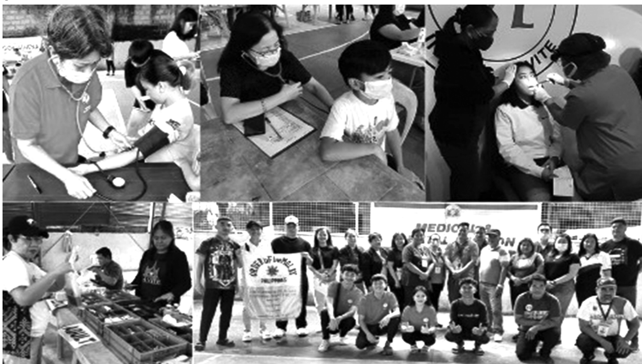
PGC extends Healthcare Services to Indang Community. In a commendable initiative to address the healthcare needs of the community, the provincial government of Cavite organized a medical and dental mission on December 22, 2023, in Brgy. Alulod, Indang, Cavite. The mission aimed to provide essential medical and dental services to the residents, enhancing their overall well-being.