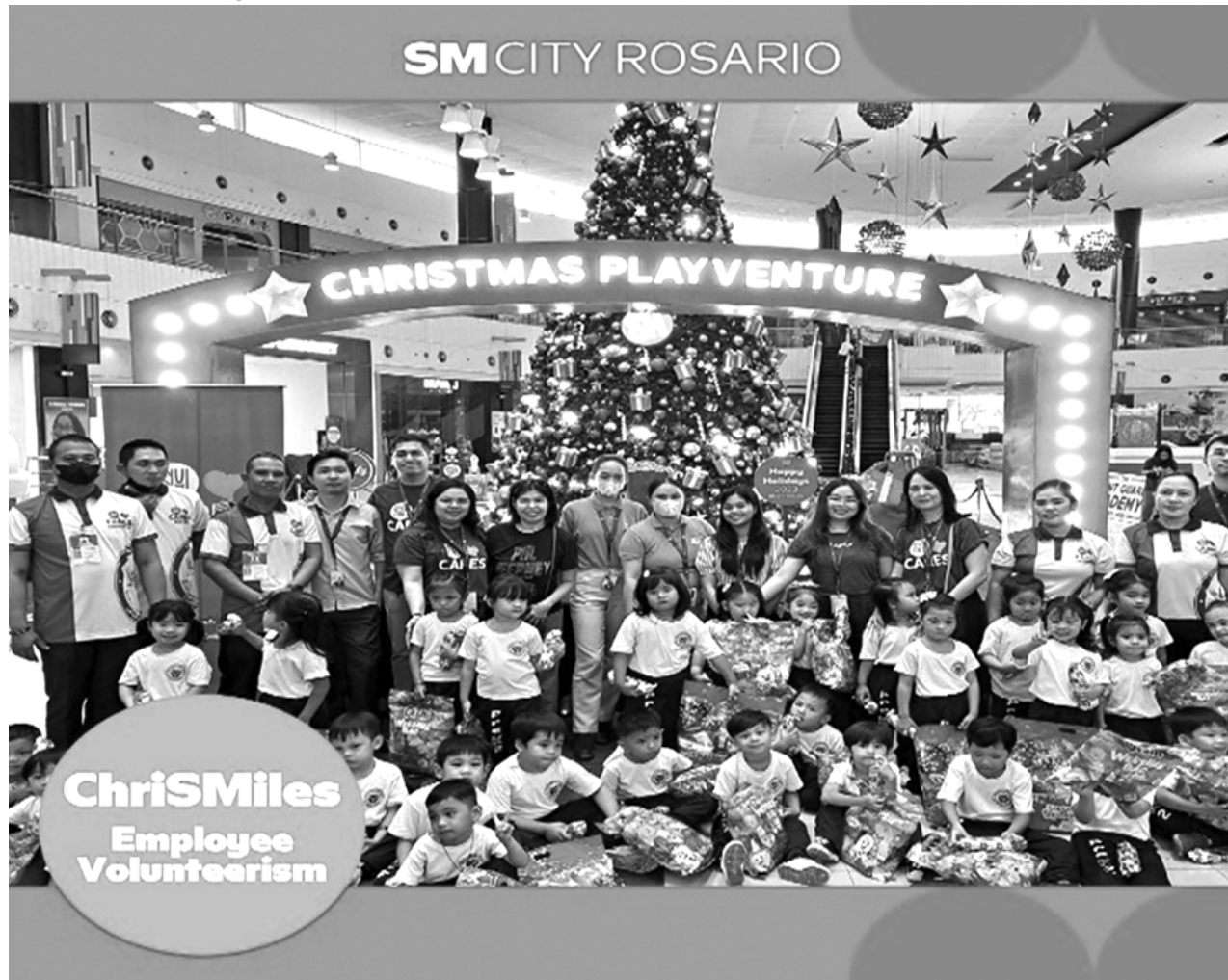
SM City Rosario employees and kids from Barangay Wawa III Child Development Center

SM malls in Cavite brought fun treats and happy day of games and surprises to children of various organizations in Cavite. This employee volunteerism program of SM called as 'chriSMiles' aims to involve SM employees in its goal to reach out to communities and give a small yet huge impact to the program's beneficiaries.