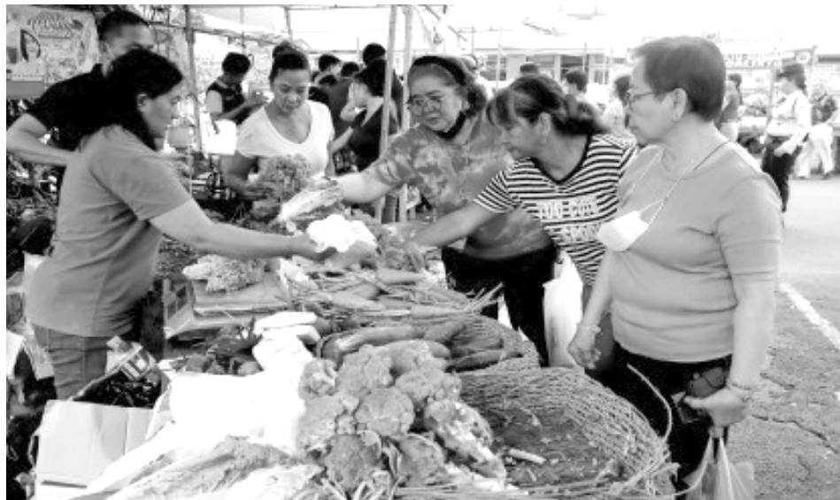
FRESH PRODUCE. Pasay City residents buy affordable produce and other food items at the Kadiwa ng Pangulo at the Pasay City Hall parking grounds on July 17, 2023. The Philippines' headline inflation further eased to 3.9 percent in Dec. 2023, lower than the 4.1 percent recorded in November of the same year, according to the Philippine Statistics Authority on Friday (Jan. 5, 2024).

Lower annual increments were also noted in clothing and footwear (4.2 percent from 4.3 percent); furnishings, household equipment, and routine household maintenance (4.5 percent from 4.7 percent); health (3.7 percent from 3.8 percent); information and communication (0.5 percent from 0.6 percent); recreation, sport, and culture (4.2 percent from 4.9 percent); and personal care, and miscellaneous goods and services (4.6