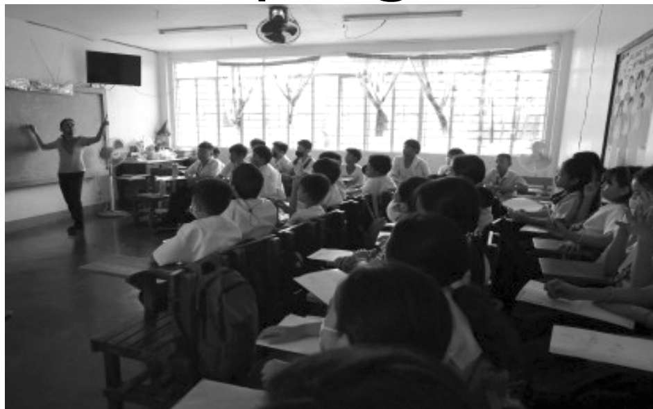
President Corazon C. Aquino Elementary School, Quezon City

Gatchalian said that based on the analysis conducted by his office using the 2019 Southeast Asia Primary Learning Metrics (SEA-PLM) data, they found that compared to their peers in Southeast