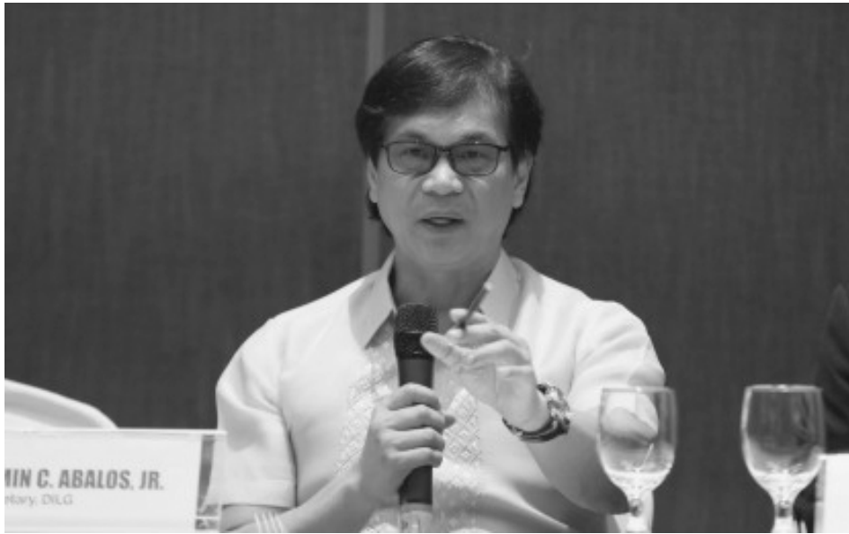
DILG Secretary Benjamin Abalos Jr. (File photo)

The Department of the Interior and Local Government (DILG) on Wednesday touted 2023 as a prolific year for the Marcos administration's anti-drug efforts.