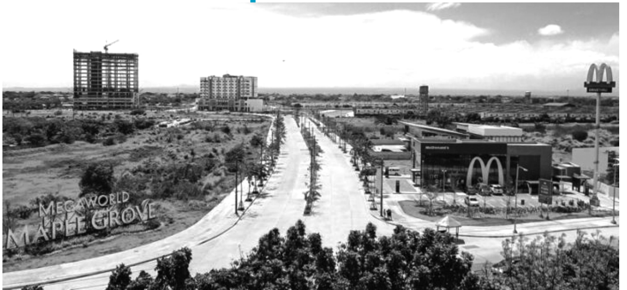
Megaworld's 140-hectare Maple Grove township in General Trias is fast taking shape as Cavite's central business district.