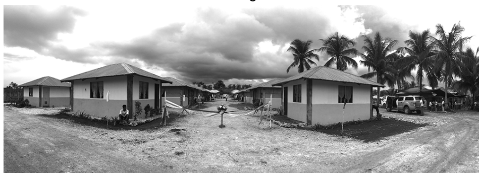
SMC Yolanda housing

Better World Community Centers: Better World Tondo, a food bank, feeding, learning, and health center; Better World Diliman, a ready