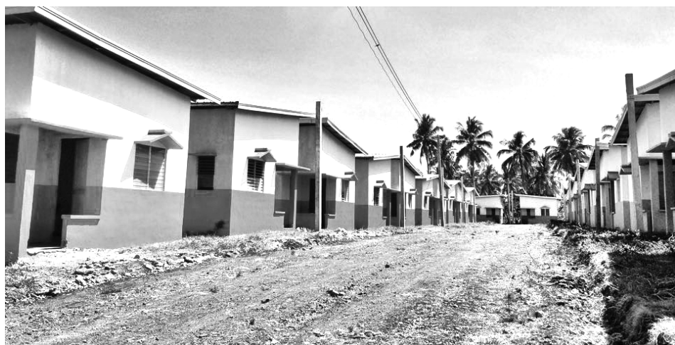
SMC Sendong CDO GK

"But just as important as housing and jobs is having a sense of