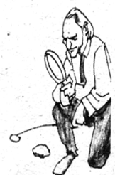
Ang unang magnifying glass ay ginawa ni Roger Bacon noong 1250.