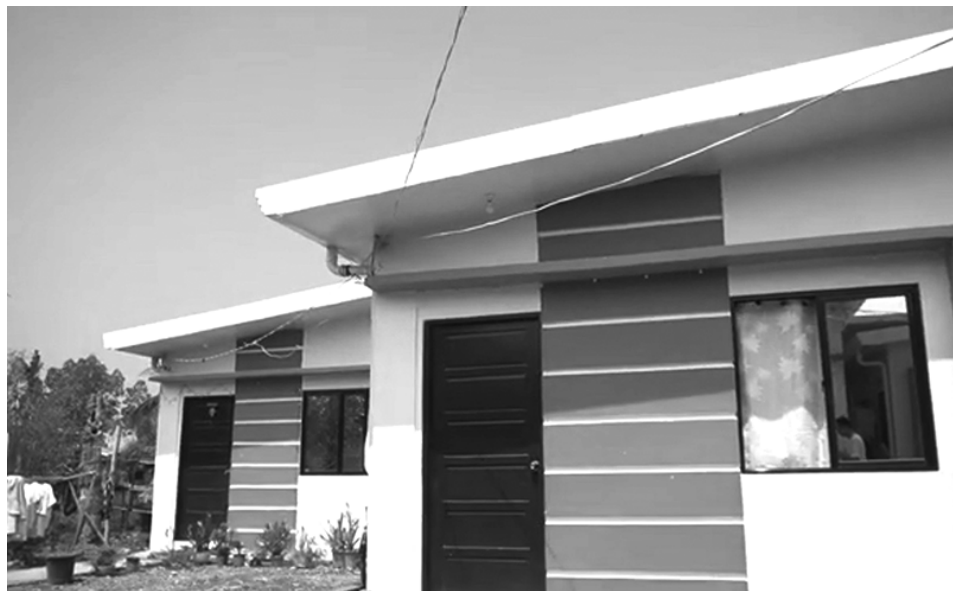
SMC Bulacan housing

Since 2013, in the aftermath of typhoons Sendong and Yolanda, San Miguel Corporation (SMC) has been at the forefront of building resilient housing communities nationwide.