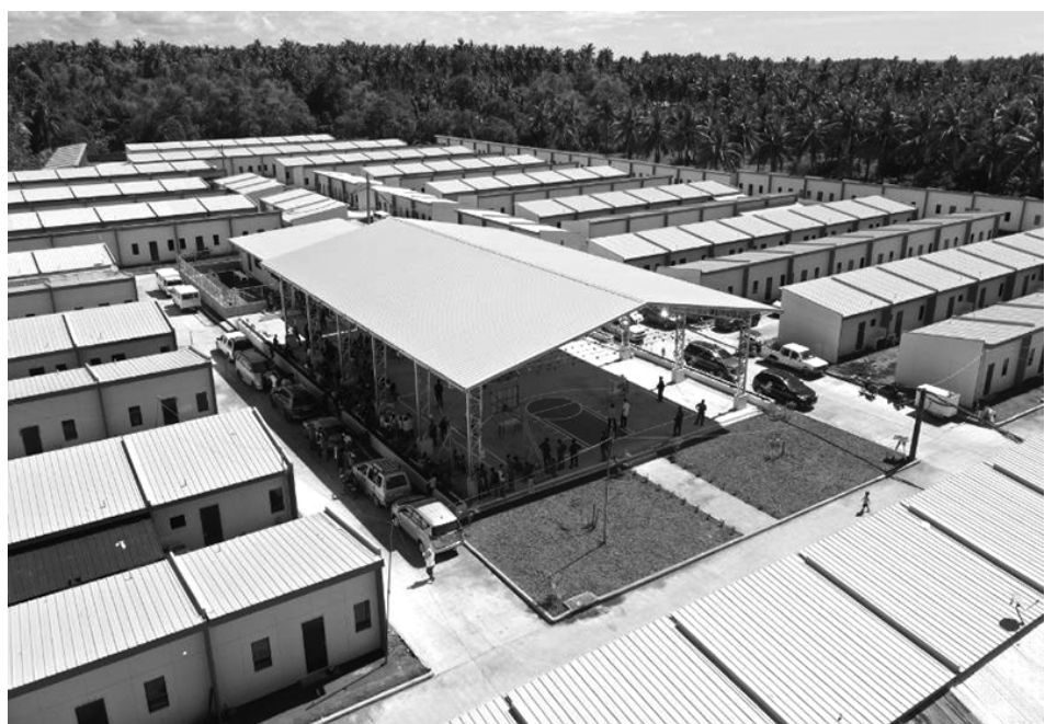
SMC Sariaya housing

livelihood training facilities, and Better World Smokey Mountain, a learning center for adults and children living in the former Smokey Mountain landfill.