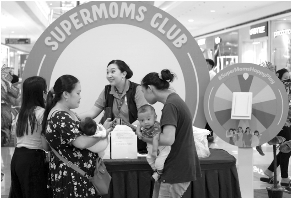
Mothers getting the DE-DEcation perks from the Supermoms Club booth during the event.

The roadshow will be held throughout August to serve as a powerful reminder of the importance of supporting mothers in their breastfeeding journey. Under the #StoriesMatter campaign of the SM Cares advocacy on Women, featured works from photographers reflect the different stories of breastfeeding mothers from various parts of the country. The exhibit launch also featured an inclusive forum with panelists representing various sectors to spark conversations on how to create safe spaces for mothers to choose and sustain breastfeeding.