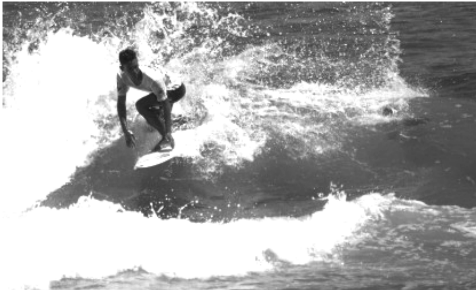
A surfer in Calicoan Island, Guiuan, Eastern Samar. (File photo)

TACLOBAN CITY – At least 200 surfers from all over the country will be in Calicoan Island in Guiuan, Eastern Samar, in September for the Calicoan Odyssey Wave 2023, the second leg of NextGen Pilipinas Surfing Nationals 2023.