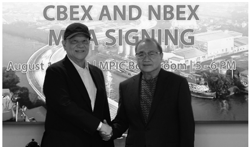
MPTC Chairman Manuel V. Pangilinan (right), signs a Memorandum of Agreement with SMC Chief Executive Officer Ramon S. Ang (left) to design, build, and operate CBEX and NBEX.

Both MPTC and SMC share a common goal of contributing to the development of road infrastructure and enhancing the transportation sector in the