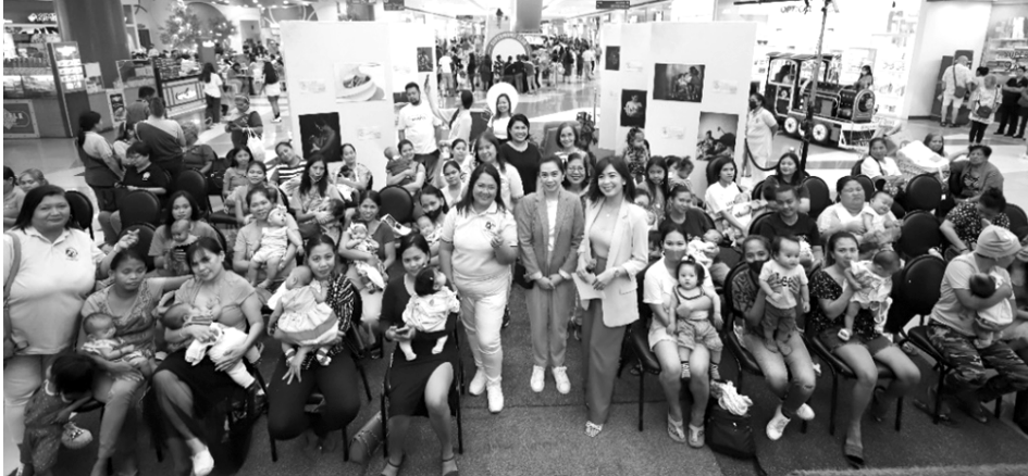
Mothers from Dasmariñas Green Ladies and partners from the public and private sector join hands with SM Cares in advocating for safe spaces for breastfeeding mothers with the Free to Feed photo exhibit and forum at (Mall Name)

In celebration of National Breastfeeding Month this August, SM Cares continues to promote breastfeeding awareness by mounting the "Free to Feed: Championing Safe Spaces for Breastfeeding at SM" forum and photo exhibit roadshow, launched at SM City Dasmariñas last August 16, 2023, together with Provincial Nutrition Office, Dasmariñas City Health Office and Dasmariñas Green Ladies.