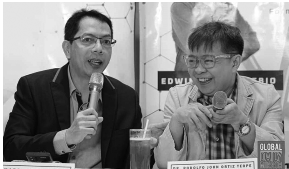
Kahit na sabihing mabalakid ang pagsulong sa legalisasyon ng paggamit ng kontrobersiyal na marijuana, parami pa rin

KAPAG naaprubahan na ng Kongreso ang paggamit ng medical cannabis o marijuana, maraming pasyente ang maliligtas ang buhay o mapahaba ito, ayon sa isang medical expert.