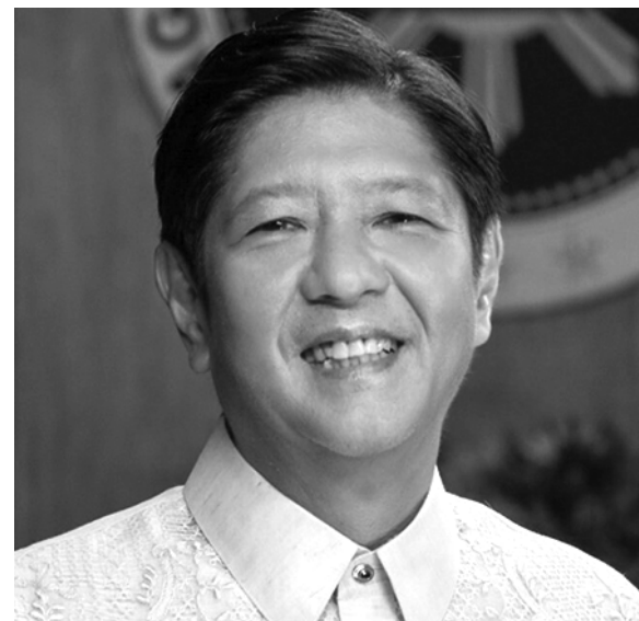
President Bongbong Marcos

President Ferdinand R. Marcos Jr. is looking forward to signing an agreement with Vietnam in a bid to strengthen maritime cooperation in the West Philippine Sea.