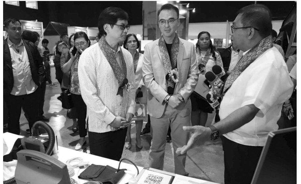
DOST Secretary Renato U. Solidum Jr. gives Senator Alan Peter S. Cayetano and Department of Interior and Local Government (DILG) Secretary Benhur Abalos Jr. an overview on the technologies exhibited in the three-day exposition of Handa Pilipinas 2023 at the World Trade Center in Pasay City.

One of these is Project SAFER, developed by the Polytechnic University of