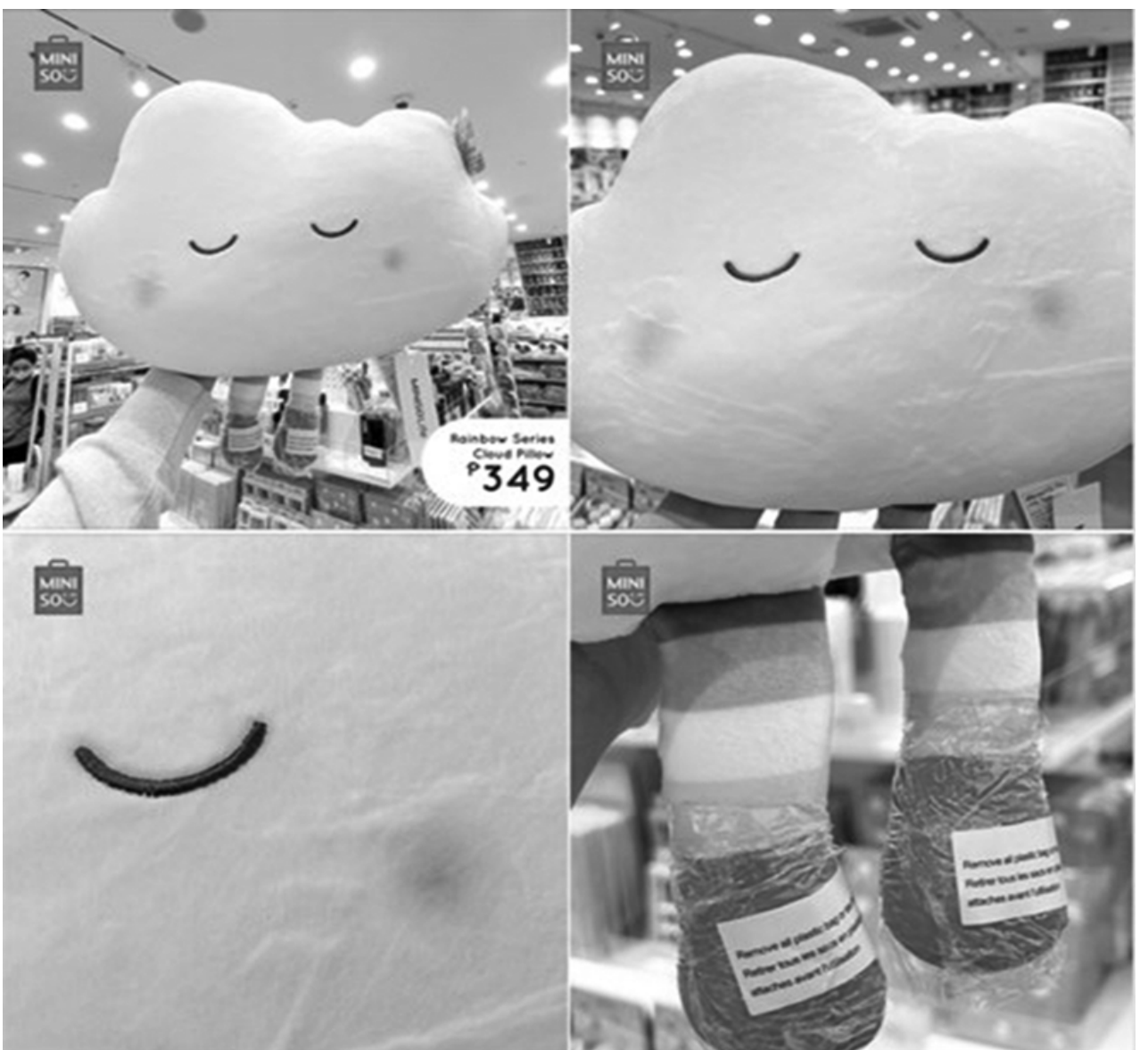
ALL THINGS CUTE AT MINISO – SM CENTER IMUS, CAVITE - What a cloudy day today! Let this Rainbow Series Cloud Pillow chase your sadness and worries away. Available for Php 349. Available at MINISO, SM Center Imus, Ground Floor. Visit today and get the cutest things at Miniso!

NOTE: All news articles and opinions expressed by the writers are entirely their own and do not reflect the opinion of the Publisher, Management of this Publication.