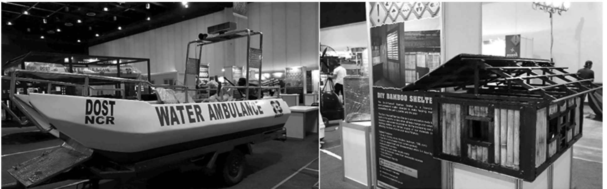
Various R&D projects and technologies were featured in the three-day exposition of Handa Pilipinas 2023 held at the World Trade Center in Pasay City.

the Philippines - Parañaque Campus, it aims to support emergency broadcast and two-way communication in disaster-prone areas. Another one is the GeoRisk Initiative Platform, a digital platform developed by DOST-PHIVOLCS and several government agencies, presented an official platform for sharing and analyzing hazards and climate information, collecting exposure data, and conducting risk assessments.